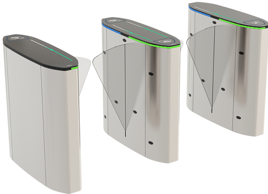
HG 02 GL-S : SINGLE UNIT (LEFT or RIGHT)