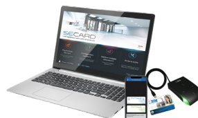
SECard configuration kit and SSCP® v1 & v2 and OSDP™ protocols