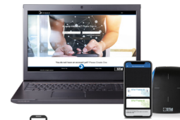
Web platform for remote management of your virtual cards

*Our readers only read the iCLASS™ chip serial number / UID PIC01444-3B. They do not read iCLASS™ cryptographic protection or the HID Global serial number / UID PIC01444-3B.