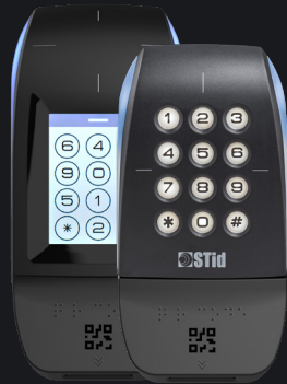
Available in keypad or touchscreen versions