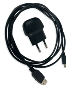
Power adapter 110 V / 220 V